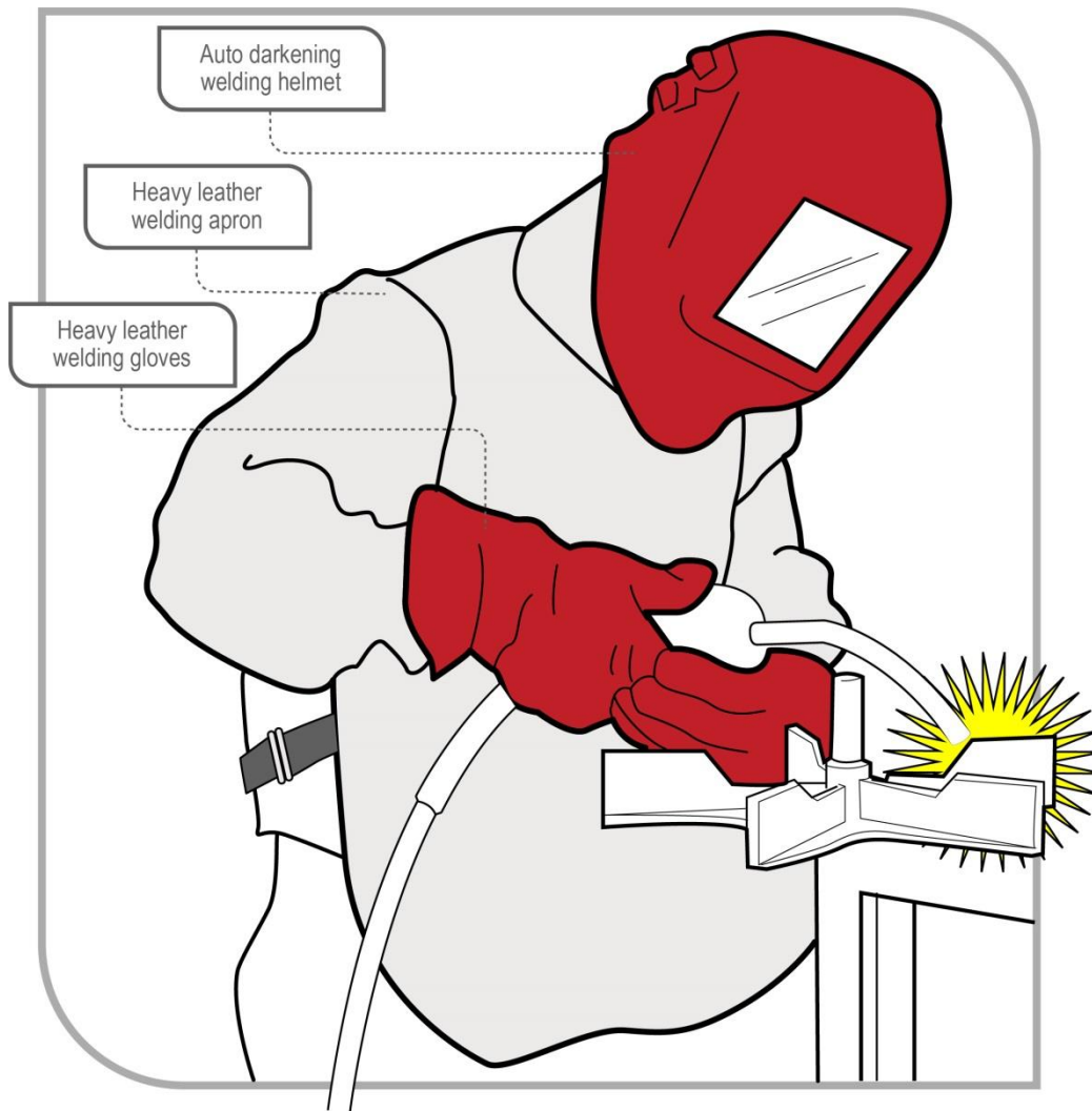
Figure 3 Worker wearing PPE while welding

When PPE is worn by workers, it should not introduce other hazards to the worker, such as musculoskeletal injuries, thermal discomfort, or reduced visual and hearing capacity.